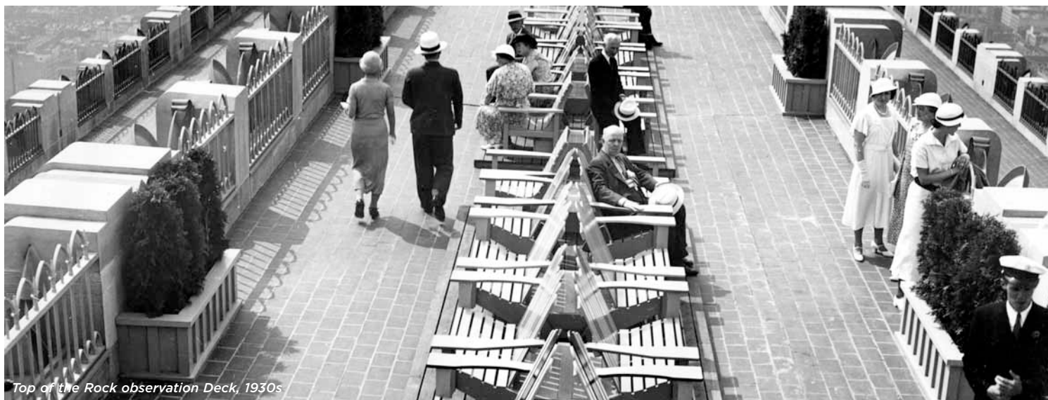
Top of the Rock observation Deck, 1930s