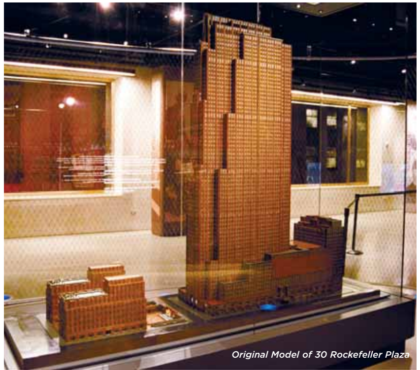
Original Model of 30 Rockefeller Plaza

11. Study Art Deco architecture. This style of architecture was popular in the 1920s and 1930s. New York City buildings designed in Art Deco style include the Empire State Building, Chrysler Building, and 30 Rockefeller Plaza. Have students create a booklet about the Art Deco movement and explain what these New York City buildings have in common.