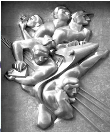
News by Isamu Noguchi