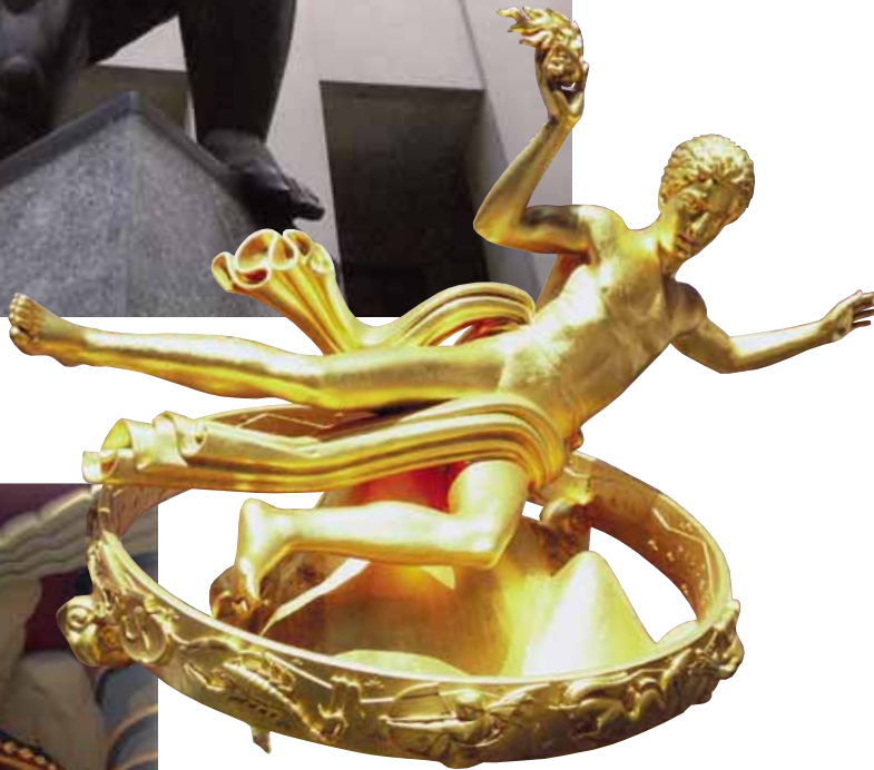
Prometheus by Paul Manship