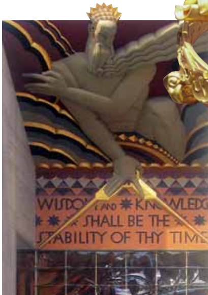
Wisdom by Lee Lawrie